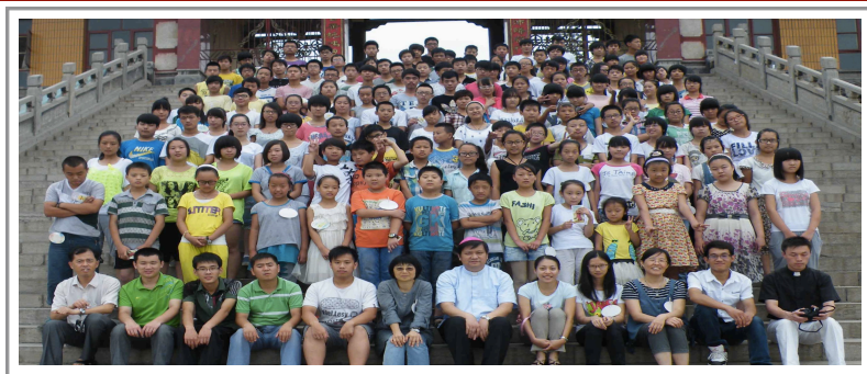
The camp brought these youth new learnings that made them value life, their relationship with others and their environment.

Seventeen Caritas volunteers organized four Summer Camps in China namely in San-Si, Si-Chuan, and He-Bei from July 6 to August 12, 2013.