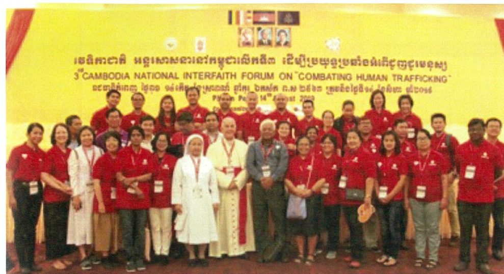
National Interfaith Forum on Combating Human Trafficking | Cambodia | August 13-17, 2019