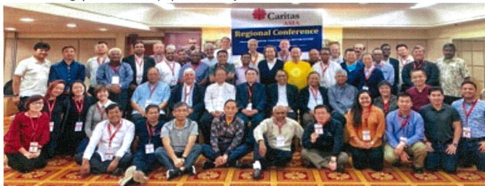
Caritas Asia Regional Conference | Bangkok | March 21-22, 2019