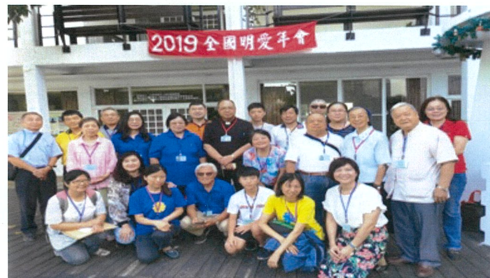
Caritas Taiwan Annual Diocesan Meeting | Hualien, Taiwan | Aug. 6-8, 2019