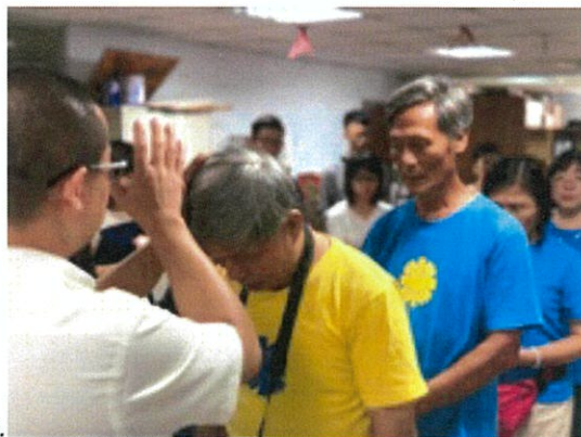
A Thai priest who is studying Mandarin in Taiwan blessed the volunteers before their departure.