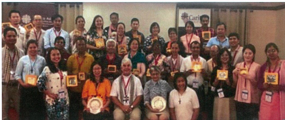
Case management Workshop on Safe Migration and Anti-Human Trafficking | Siem Reap | February 25-28, 2019