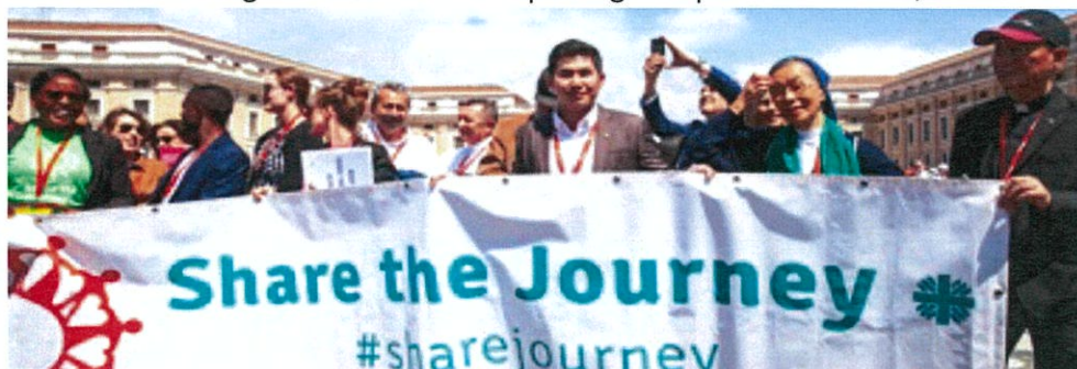
21st CI General Assembly | Rome | May 23-28, 2019